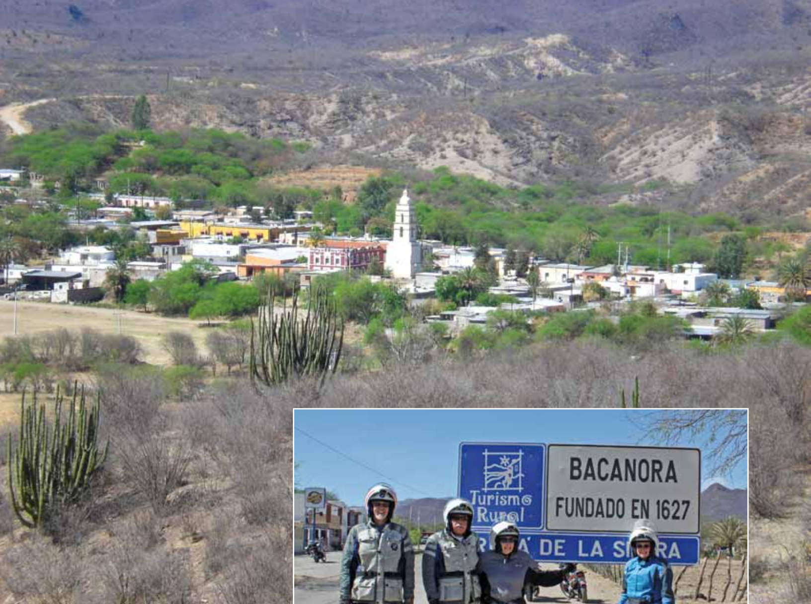
Bacanora taken from above.