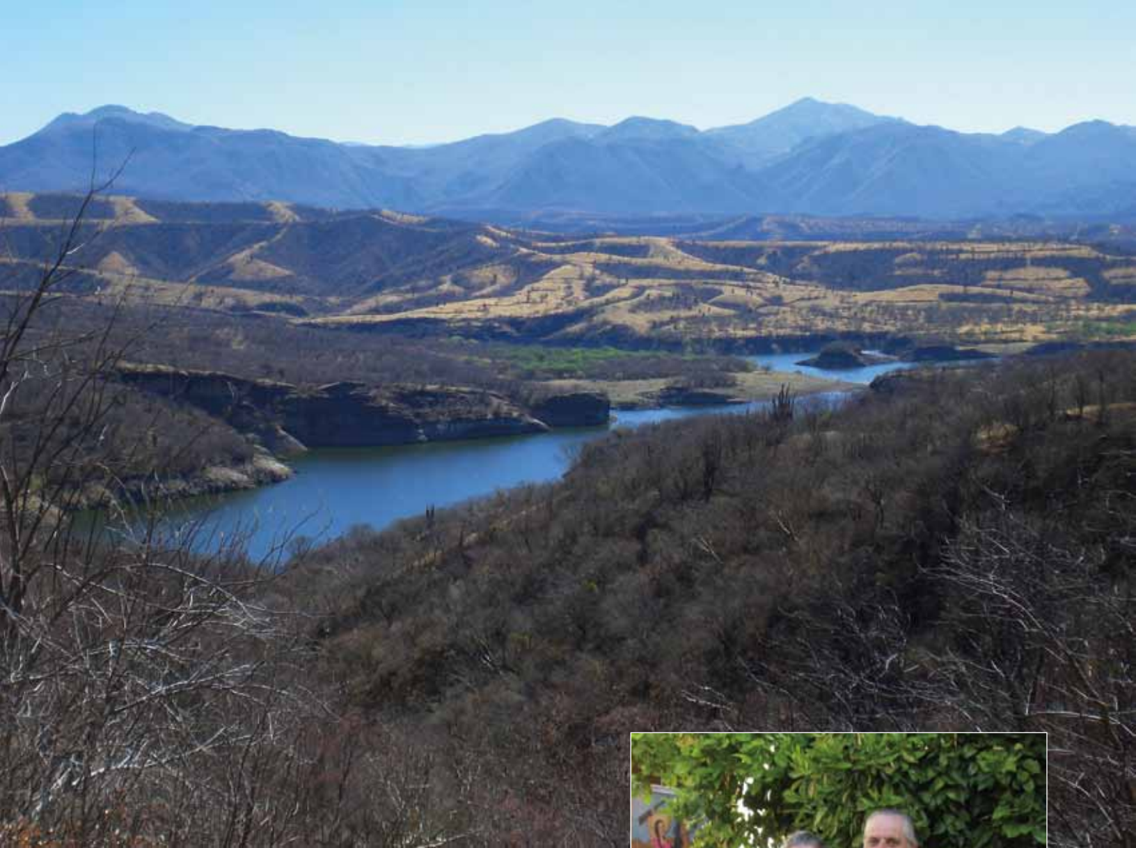
Landscape in Sierra Madres.