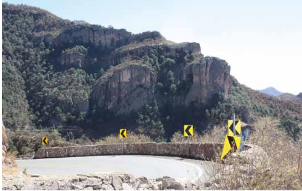
Another great curve.

Below: Church in Arivechi Right: Dome of Gazebo in Arivechi