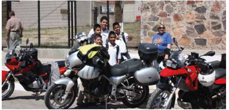
Nacazori boys singing a cappella.

The citizens of Bamori were out on the plaza just visiting and enjoying the cool evening. Everyone was friendly and greeted us warmly, some in English. The nearly full moon lit the white front of the church with an almost translucent glow.