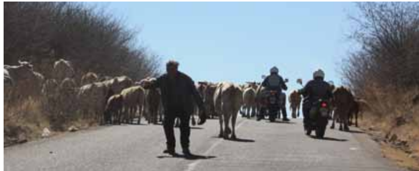
Riding through herd of cows out of Bamori.