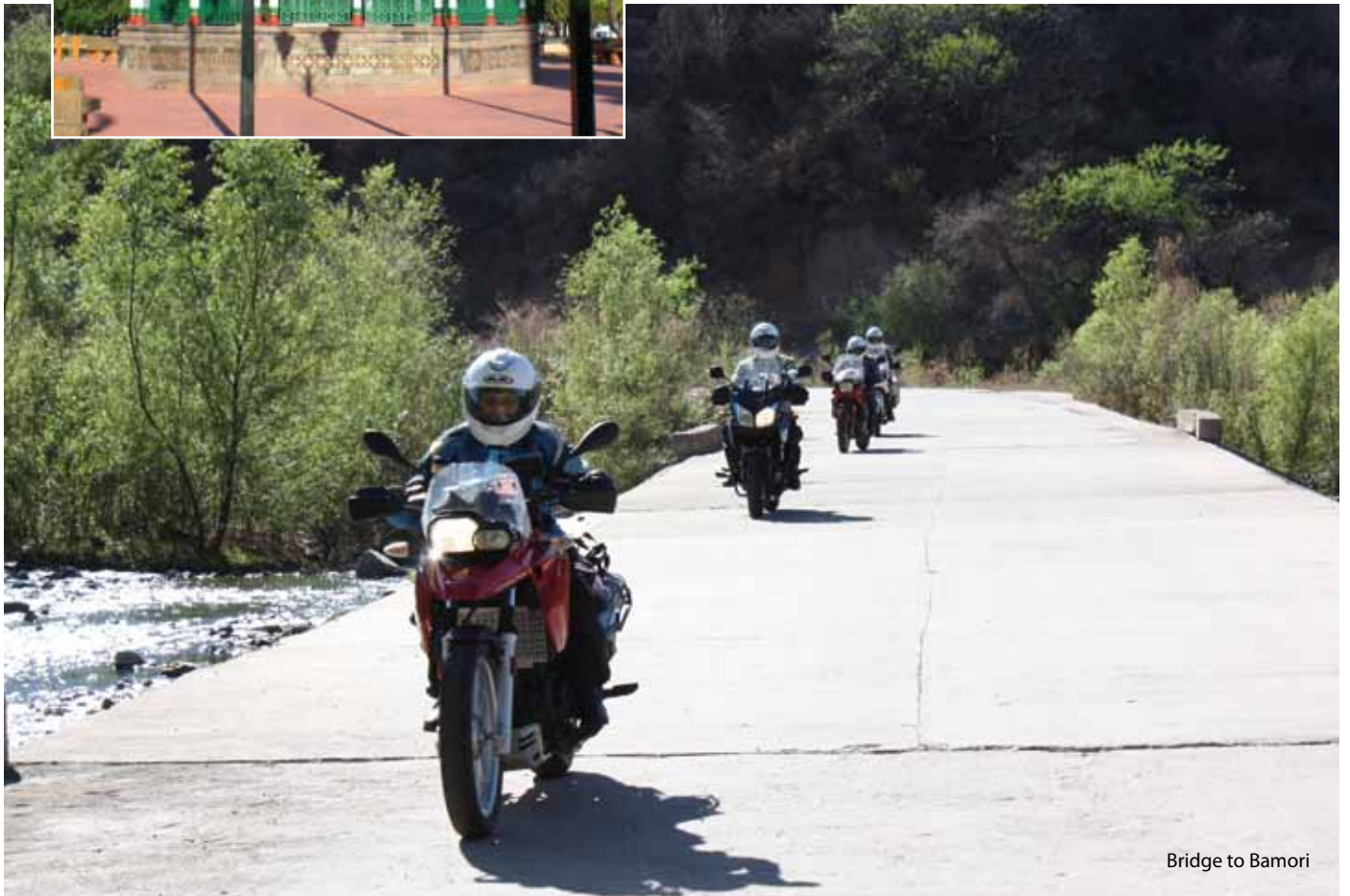
Bridge to Bamori