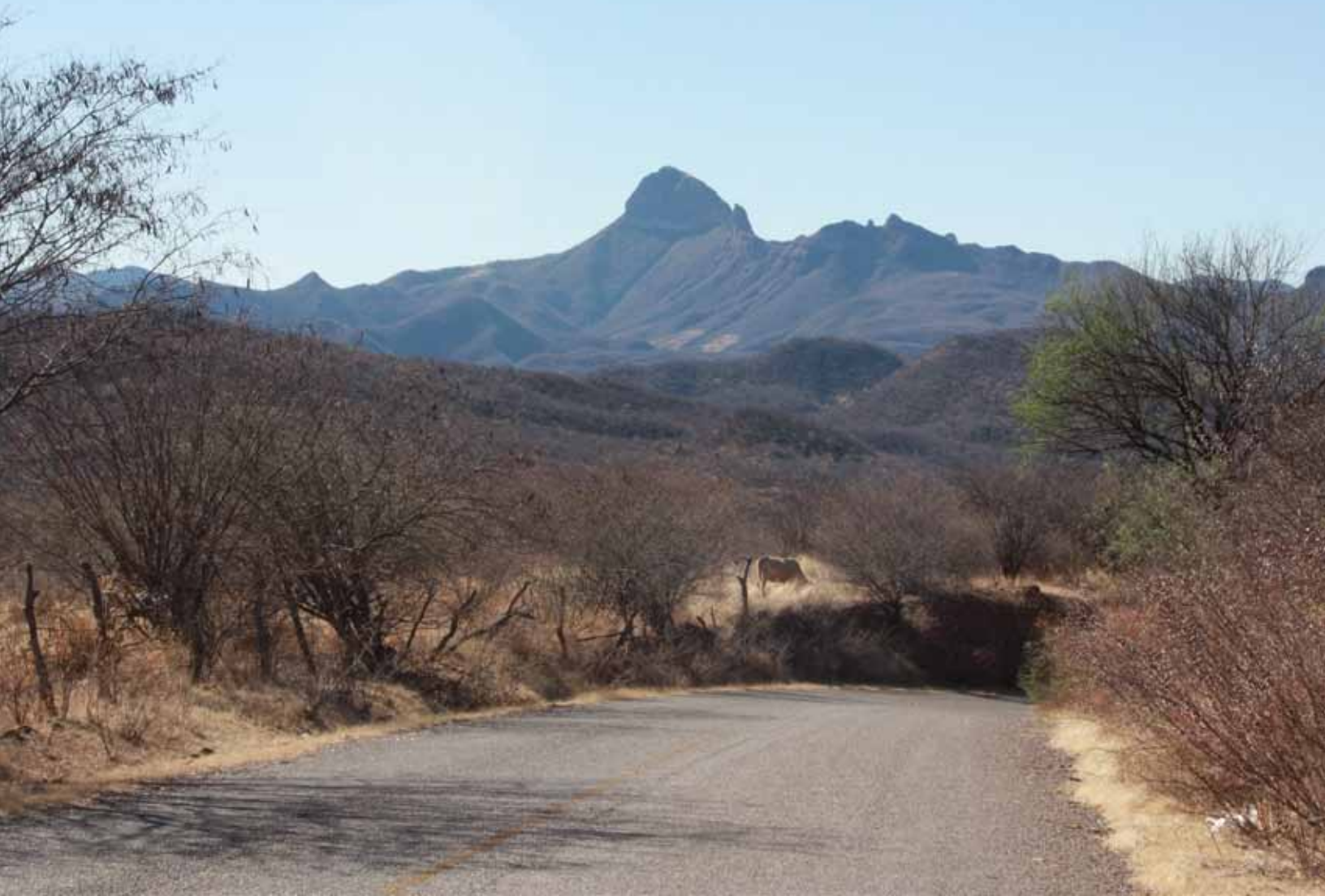
Landscape in Sierra Madres.

live full time in Mexico and tour the Baja and Sonora. The hotel is in part a restored, original adobe and in part new construction. It opened in September of '09. It is classical Sonoran Colonial style. The patio is large, full of plants and flowers and has a pond and waterfall. We sat in the patio and sipped Bacanora and talked about the ride and how magical Mexico was.